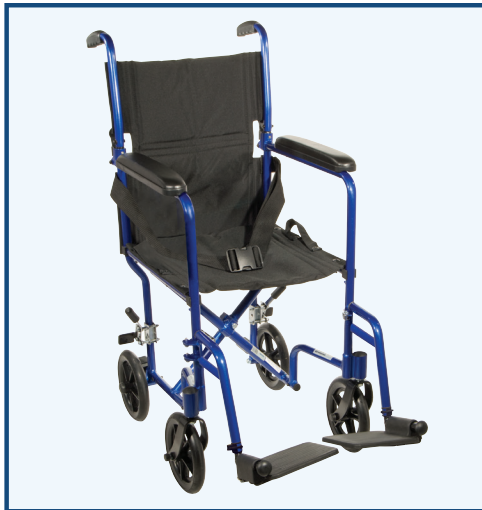
REF. ATC-BL Shown

It is important for the attendant to be familiar with proper assisting procedures in any situation that requires the use of the Transport Chair. Safety is the Key consideration. Consult your physician, nurse or physical therapist to determine methods most suitable for your individual needs and abilities.