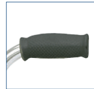
Contoured vinyl hand grip